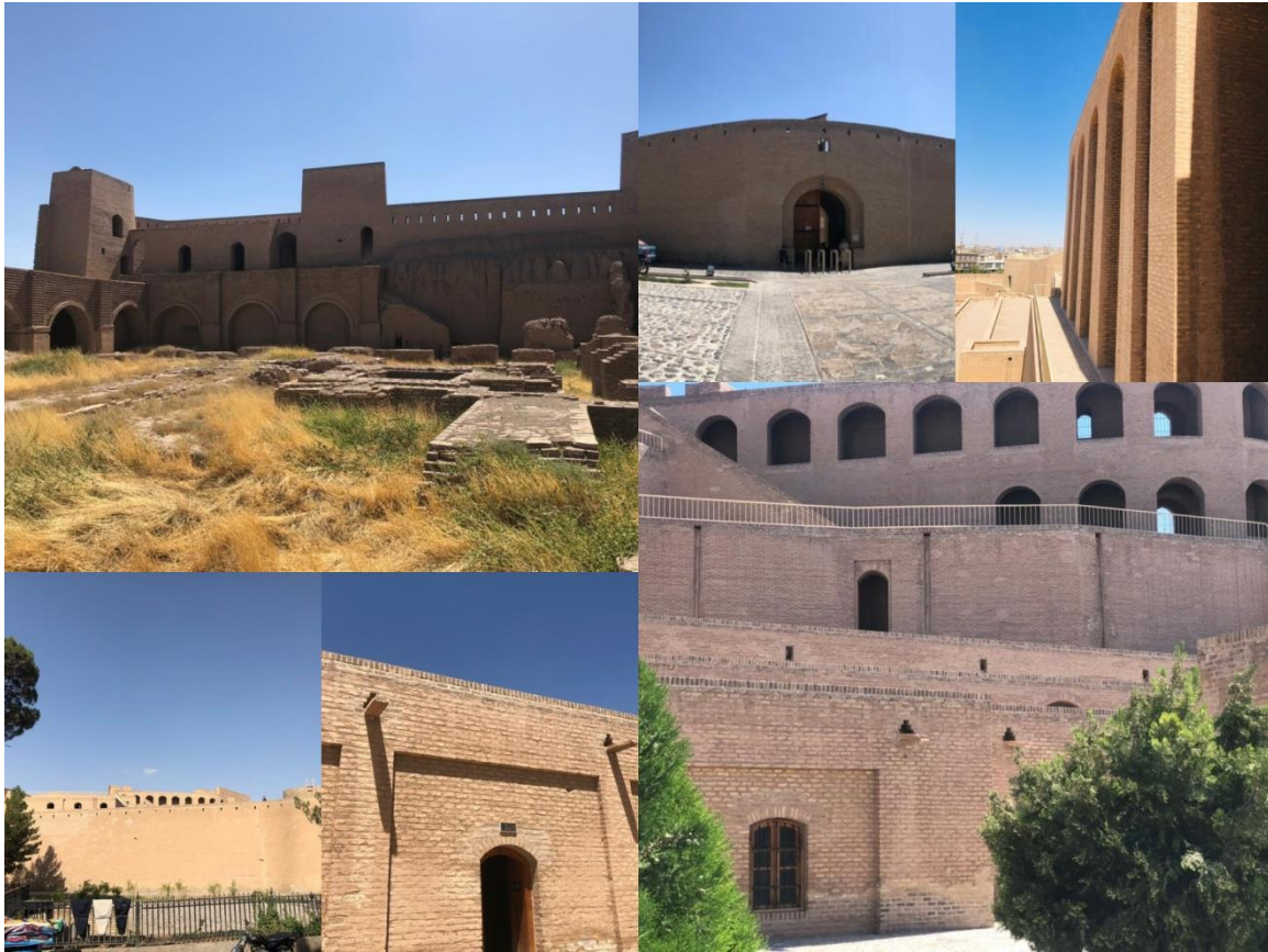
Figure 3: Current stage after restoration