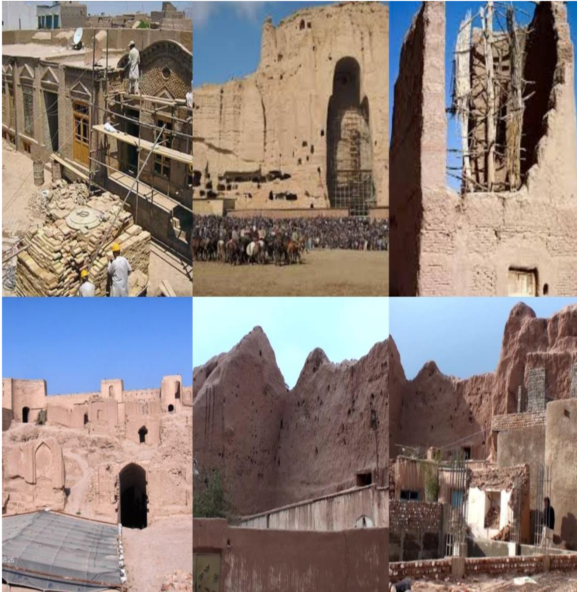
Figure 2: Ruins of ancient city walls